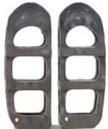
The evolution of the PLIF cage with the bullet tip design facilitates the insertion.